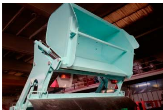
Unloading height of 2.5m