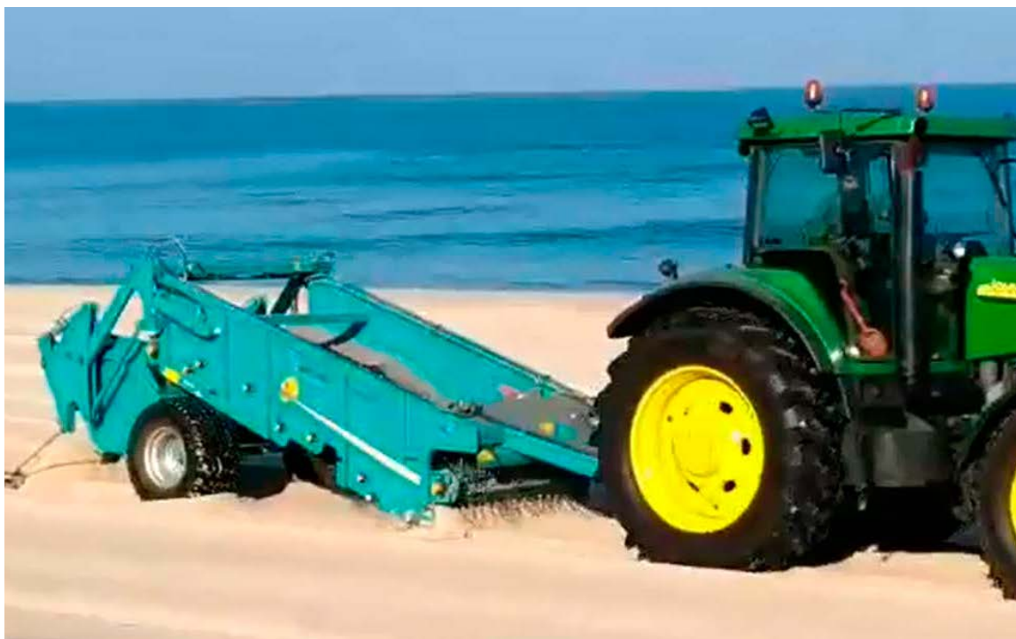
Efficient and economical unit