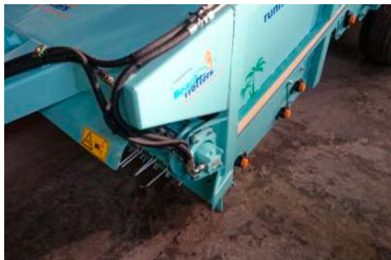
Working width of 1.900mm