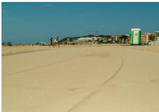
Smooth flattening Reference option for UNICORN Runner Evolution