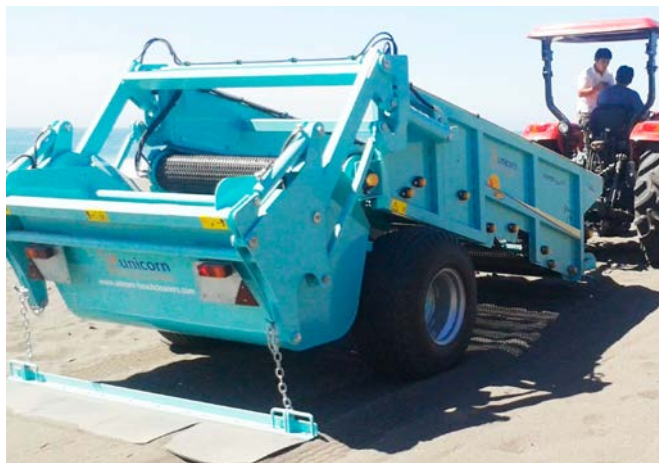
Hopper of 1,5m 3 Reference option for the UNICORN Runner BL