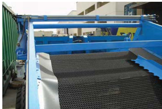
Triangular interlocked mesh of 23mm in carbon steel of high resistance