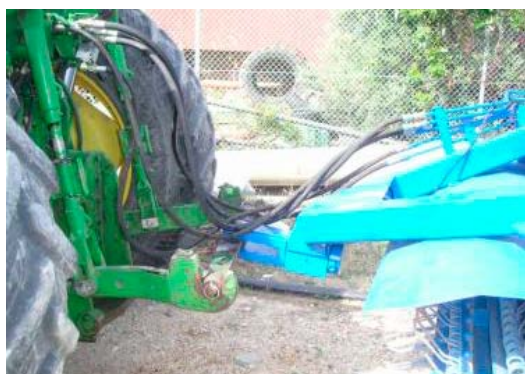
Hitch bar of fish mouth type