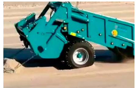
Floating tires 500/50 17 class