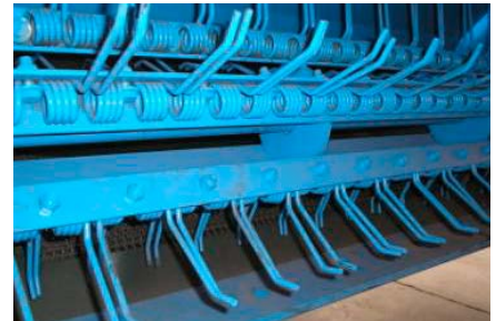
Frontal roller of spike system