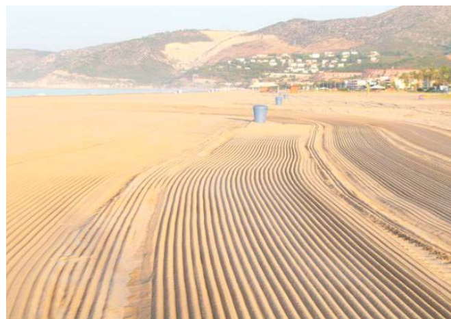
Raked flattening Optional