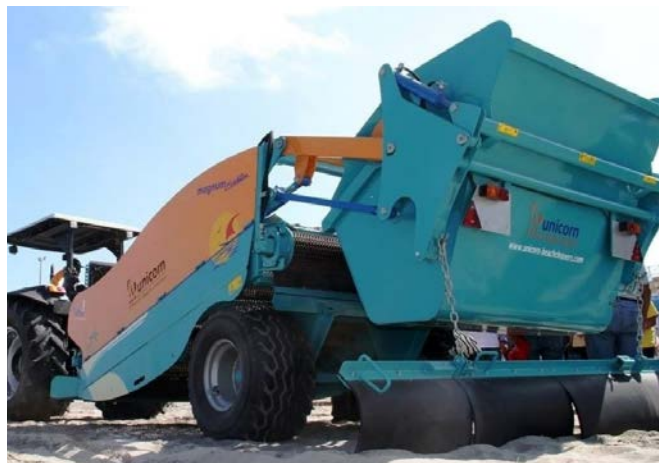
Hopper of 2,5m 3 Optional