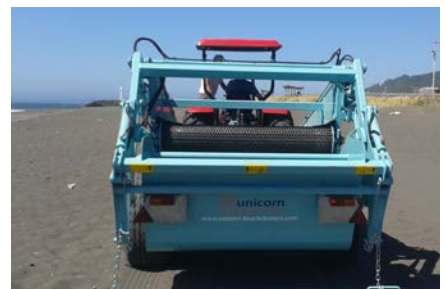
Smoothing bar and road lights